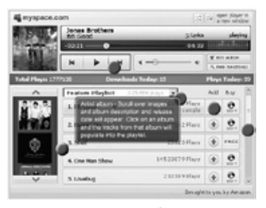
Artist Album Scroll

The improved music search engine in the MyMusic page, on which users can search by artist name, album, or song, has similar benefits. The easier interface allows for a smoother search for formerly not-so-savvy music fans. Once fans have found what they're looking for, the dragand-drop search feature allows users to then seamlessly add their customized playlist(s) to their profiles. This improves the efficiency of getting artists' songs from the artists' music page to the fans' page. Even if the bands