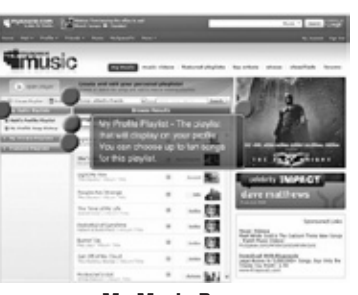
My Music Page